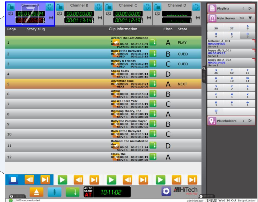
Screen shots of the AViTA News software application and the run-down list

The directory of clips is fed from the video server to the NRCS through AViTA News, along with the status of the current clip. The NRCS is dynamically updated with the status of all clips in the rundown list.